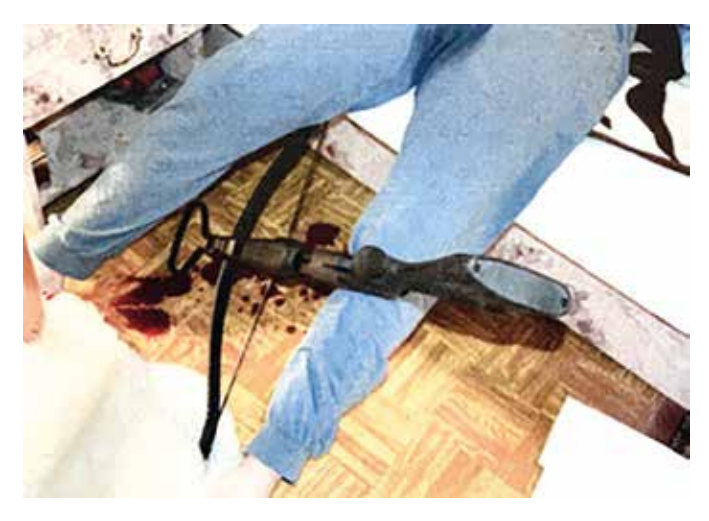
Fig. 1. View of a crossbow between man's feet on the floor.

the left scapula, and 6.5 cm to the left to the posterior midline (Fig. 3). After the removal of the bolt, the edges of both wounds were approximated. The both wounds were in the form of triple radial, smooth-sided cut, with lengths between 3.7 and 2.2 cm of the entry wound (Fig. 4) and between 1.5 and 1.5 cm of the exit wound (Fig. 5) after reconstruction of the wound edges. These wounds patterns correlated with a three-bladed bolt tip with one broken blade. The bolt passed through the third intercostal space, pericardial sac, left ventricle of the heart, lower lobe of the left lung (Fig. 6), 7th intercostal space slightly to the right of the scapula line with breaking off the upper edge of the 8th rib and the tip was located out of the chest behind the exit wound. The wound track was approximately 25 cm in total length. There were 950 g of blood clots and 400 ml of liquid blood in the left