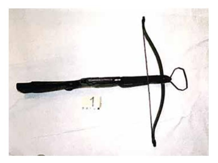
Fig. 7. Detail view of the used recurve crossbow.

about four months before his death. During that period, repeatedly under the influence of alcohol, he telephoned her, especially on weekends, and threatened to kill himself or kill himself on a motorcycle. At the time of question before his death, he called her at 11:40 p. m. to come to him, which she refused. Then at 1:11 a.m. he sent her an MMS with a crossbow photo and the text "you are to blame". She texted him back to stop doing this. In turn, at 1:32 a.m., he called her again to come to him and when she refused, she heard a shot. Since the man was under the influence of ethanol in the stage of tipsiness at the time of death, it can be assumed that the consumption of alcohol was likely to deliver courage. The scars found at autopsy on the left forearm most likely suggest a previous suicide attempt in the past. Another exceptional aspect of the present case is that the cases of chest injuries described in the scientific literature are penetration injuries only. In our case, it was a perforation injury, i.e., the bolt pierced the full thickness of the chest.