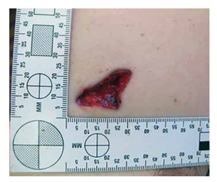
Fig. 4. Detail view of the entry wound.

The presented case study is interesting from several points of view. The use of a mechanical firearm – a crossbow – as a wound-