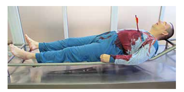
Fig. 2. General view of a man's body before autopsy.