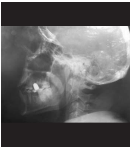
Figure 1. A bullet is seen in the tongue.