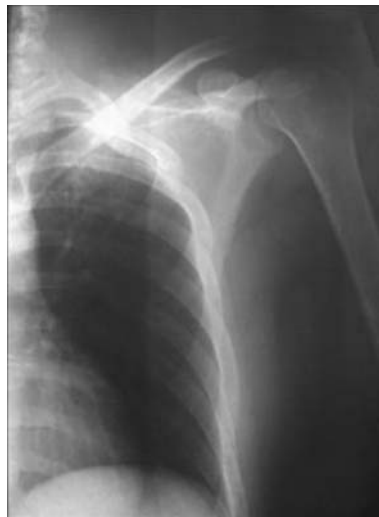
Figure 2. Thoracic X-ray is normal.