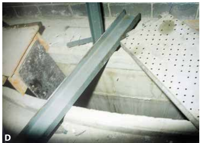
Figure 1. A, B, D: building where the accident took place. C: linear laceration involving the skin and subcutaneous tissues, 8 cm long, in the right frontal-zygomatic region.

was sufficiently wide to allow equipment to be transferred between the floors. Some wooden planks had also fallen together with the worker. No one heard the first worker crying out as he fell (Figure 1A, B, D).