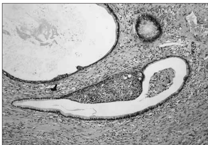
Fig. 3. Large mucinous glands with focal squamous metaplasia (H&E, 200)

intraluminal eosinophilic, homogeneous, PAS-positive, and Alcian blue negative secretion. However, the cytoplasm of these cells contained no PAS or Alcian blue positive substances. Furthermore, a few larger mucinous glands, some of them with apparent squamous metaplasia, were present (Fig. 3). A single layer of columnar cells with ample clear cytoplasm lined these glands. The cytoplasm of these cells was Alcian blue and PAS positive. The stroma was dense,